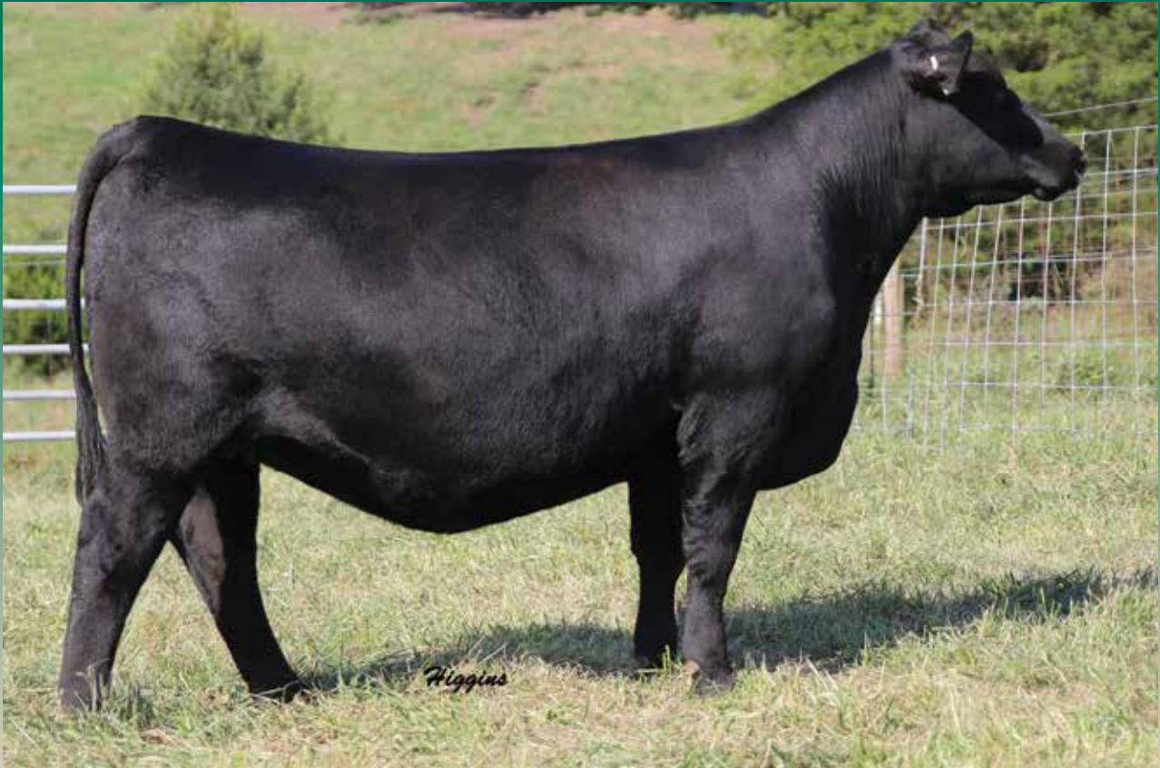
Dam of Lot 3.

Lucy 748 is a unique, powerful next-generation donor.