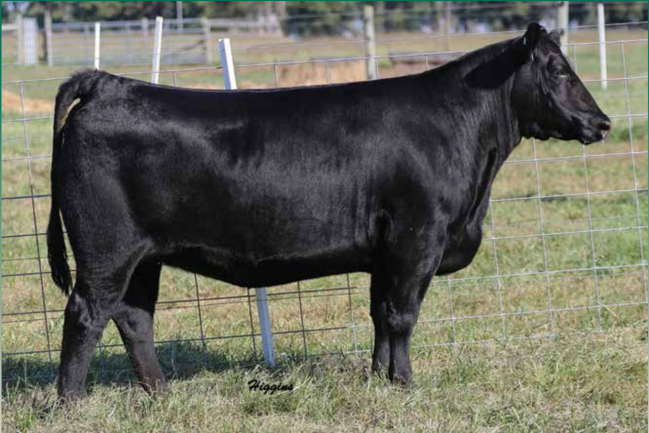
Dam of Lot 7.