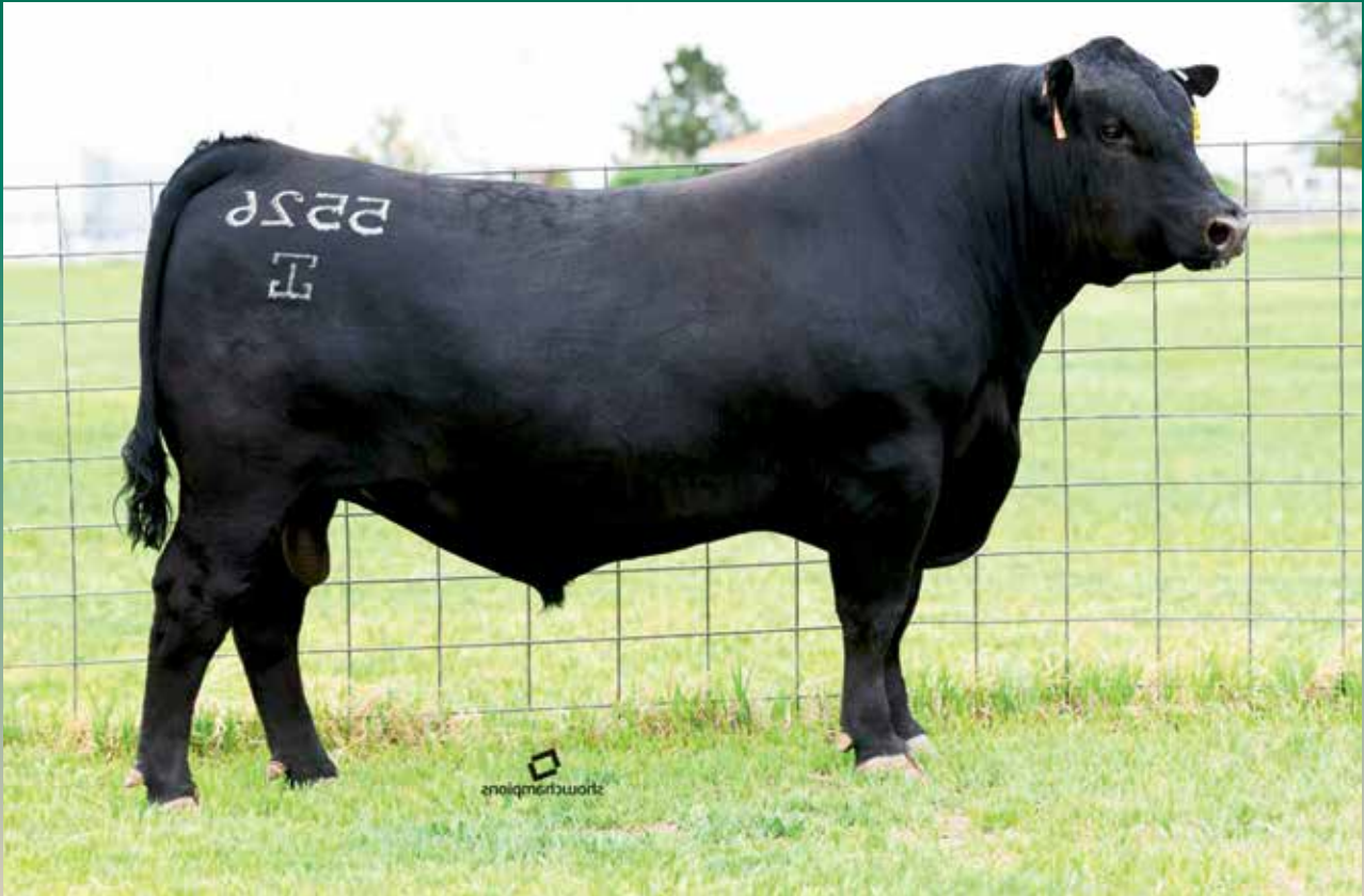
Sire of Lot 2B.