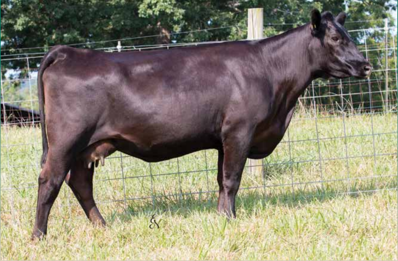
Dam of Lot 10.